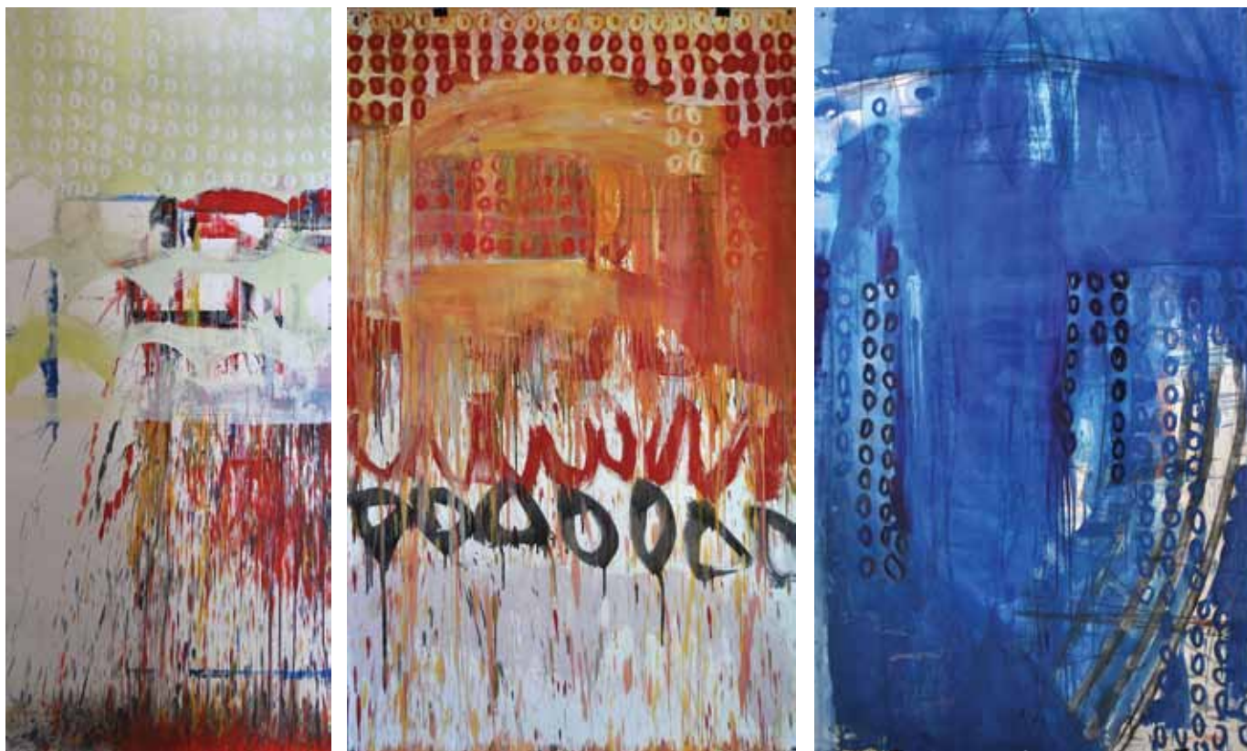
Sara Siestreem, Ballast , oil and graphite on paper / So I Hear You Like Sunsets , oil and graphite on paper / The Canadian Sea Lark , oil and charcoal on paper. ▲