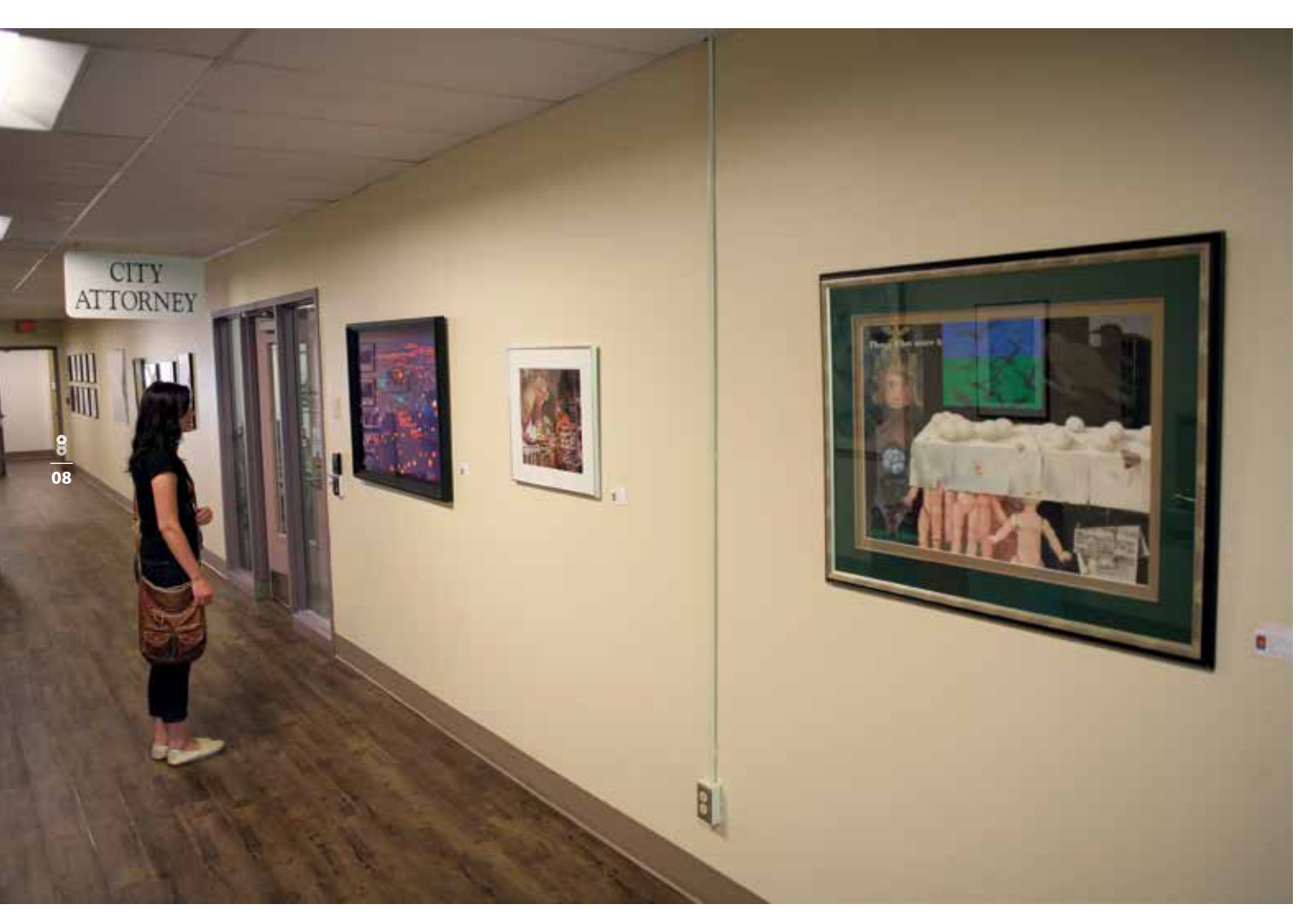
Art In Public Spaces: City Hall, 2nd Floor.