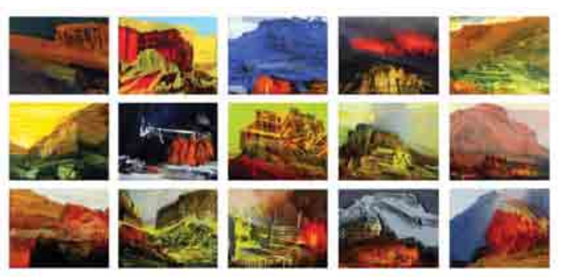
WHAT A PAINTING DOES IS BRING YOU OUT TO THE EDGE OF PERCEPTION, OUT IN THAT PLACE WHERE THERE ARE PROCESSES HAPPENING THAT WE'RE NOT USUALLY AWARE OF. PAINTING IS A TELESCOPE POINTING INTO WORLDS WE CANNOT OTHERWISE SEE. THERE IS PHYSICALITY TO PERCEPTION; THERE IS HUMANITY IN THE ACTION OF MAKING A PAINTING. ///

▲ James Lavadour, Straight Ahead, 2010, oil on panel, 76 X 158". Collection Of Nate Overmeyer.