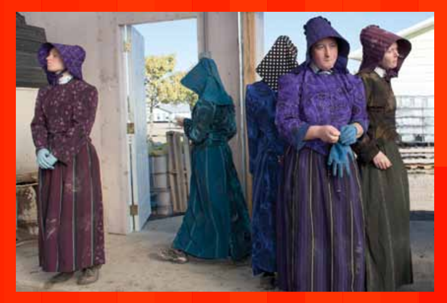
HIDING IN PLAIN SIGHT: PHOTOGRAPHING THE HUTTERITES OF LIBERTY COUNTY BY JILL BRODY Mondak // Nov-Dec 2013 Carbon Co Arts // November 2014