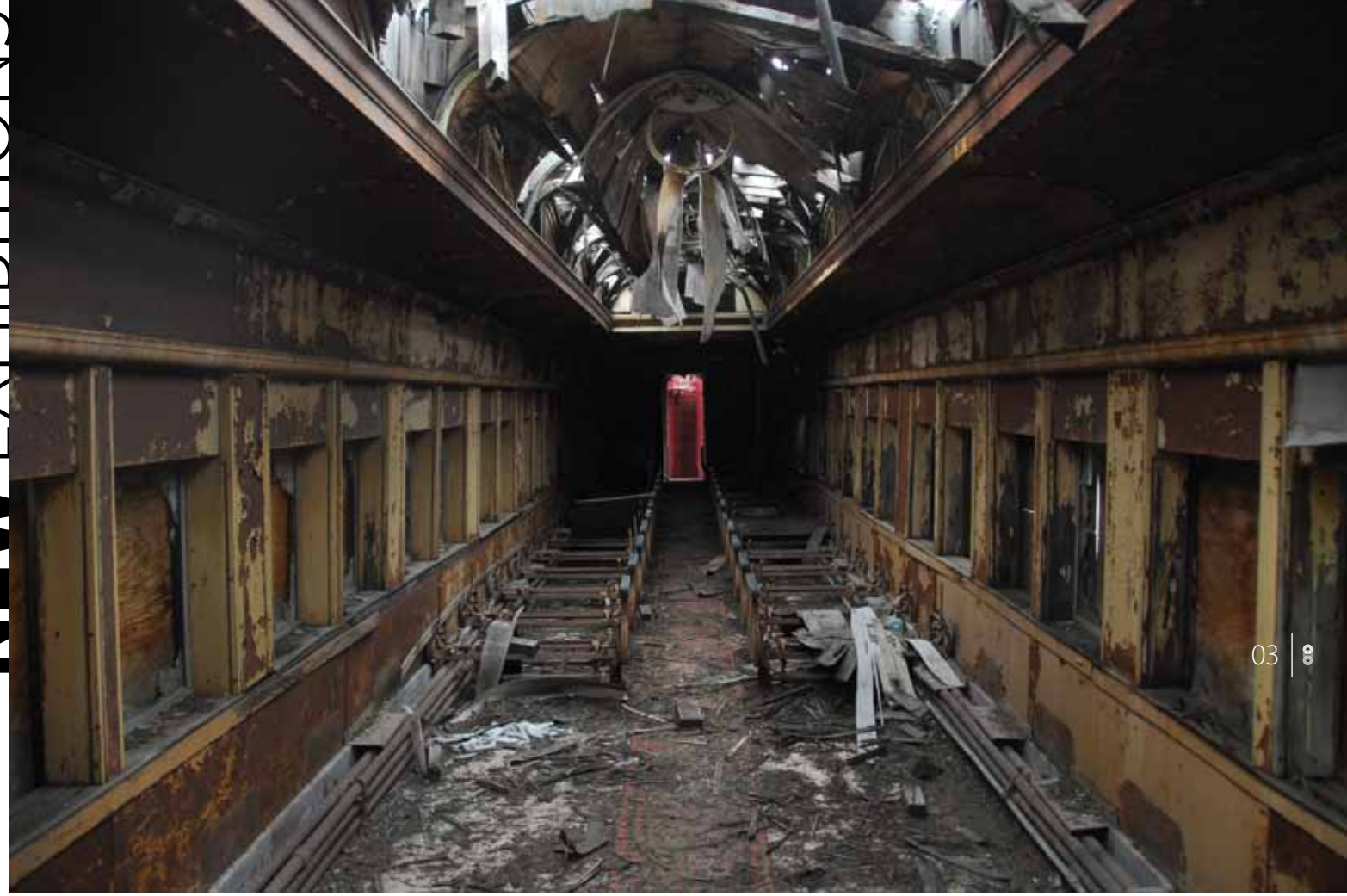
Brian Herbel, Passenger Rail, photograph.