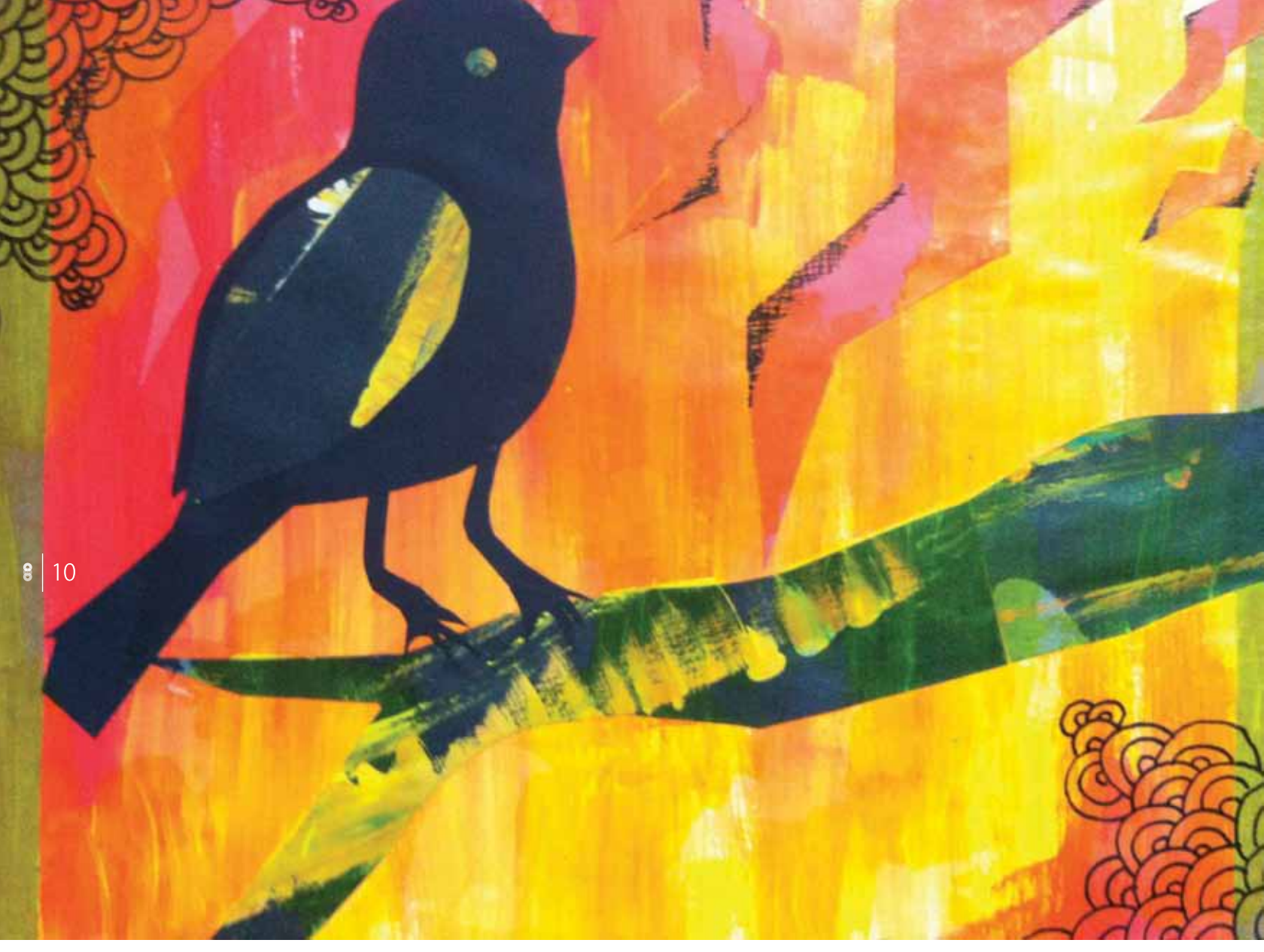
Morgan Elrod, Untitled, mixed media.