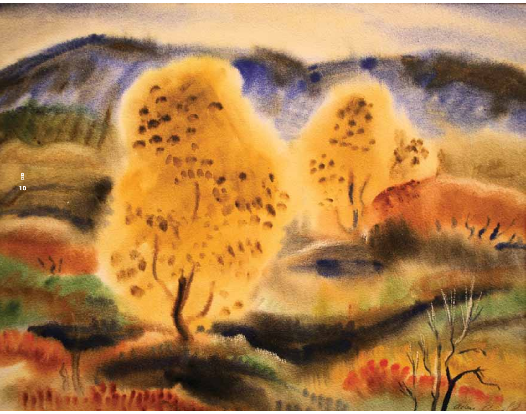
Aden Arnold, Untitled , watercolor.