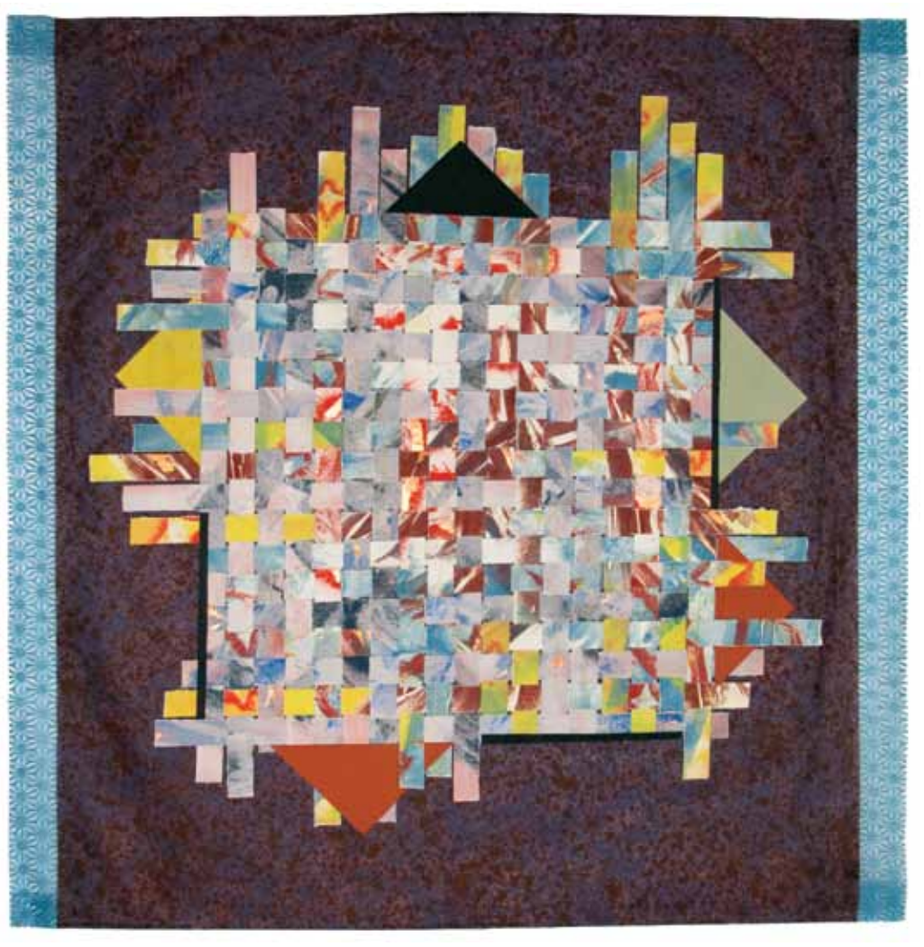
Karen Goulet, Exquisite Departure , mixed media. ▲